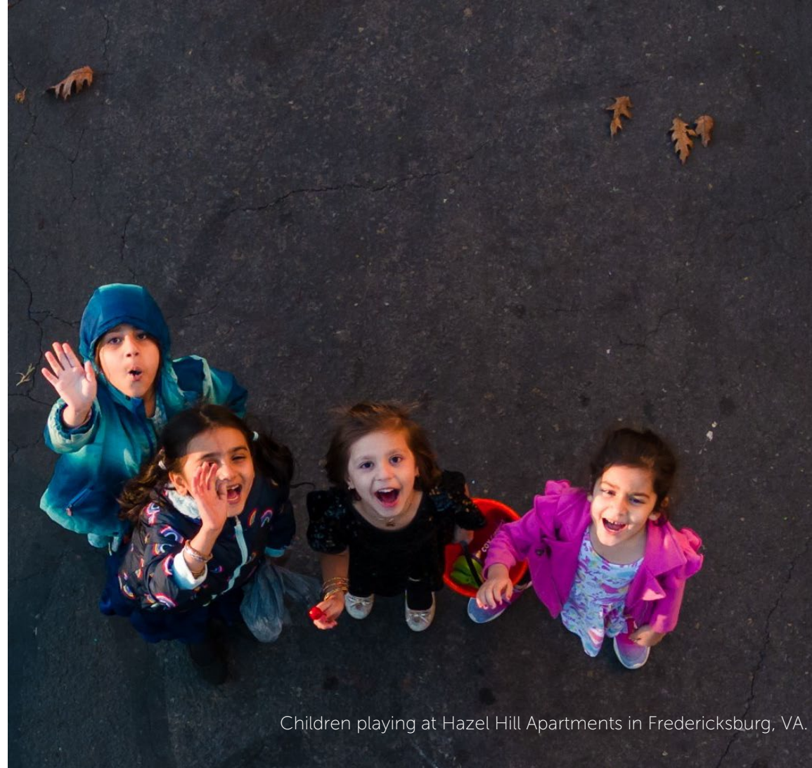
Children playing at Hazel Hill Apartments in Fredericksburg, VA.

FOR 40 YEARS, our passionate team of experts and advocates has worked to ensure people can be proud of where they live. In 2026, we'll unite leaders, practitioners, funders, lenders, and policymakers to celebrate progress, reflect on our journey, and shape the future—together.